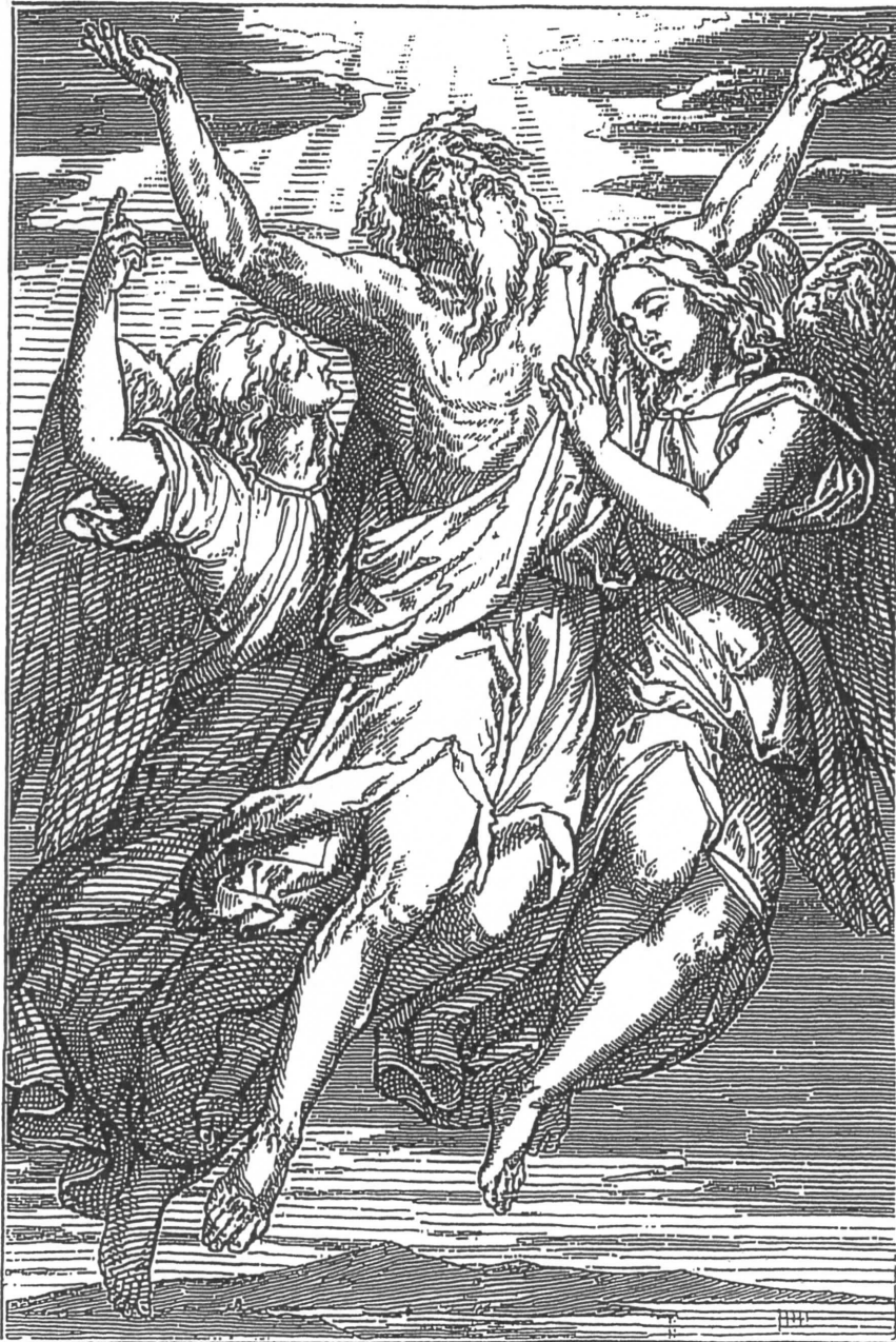
LAZARUS CARRIED TO HEAVEN.